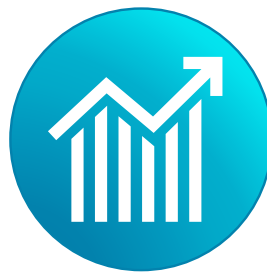
Financial Engineering Expertise